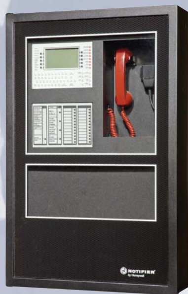
ONYX Digital Voice Command