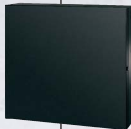
Digital Audio Riser